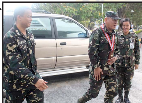
Visit of Commander, AFPPS to 407th CO, PMA, Fort del Pilar, Baguio City.