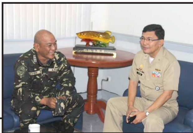
Courtesy call to Commodore Nodolfo V Tejada AFP, Commander, Naval Forces Northern Luzon, Naval Station Ernesto Ogbinar, Poro Point, City of San Fernando, La Union.