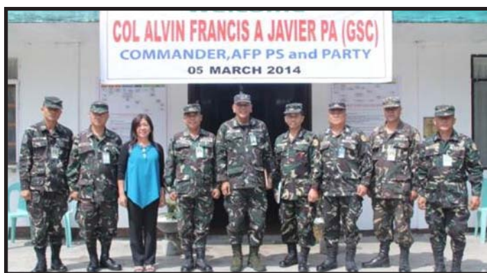
Visit of Commander, AFPPS to 202nd CO, Fernando Air Base, Lipa City, Batangas.