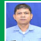
YN2 ORLANDO C ARCA 708893 PN - Promoted to YN1