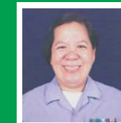
SK2 ZIPORA Y PACIFICO 791090 PN - Promoted to SK1