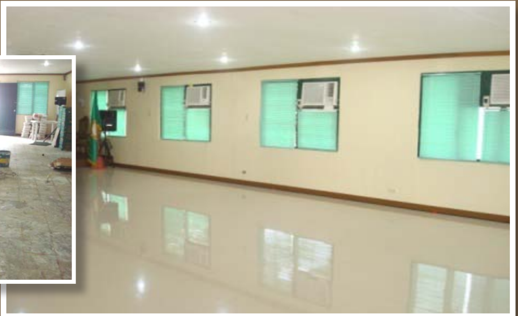
Renovation of the AFPPS Multipurpose Hall