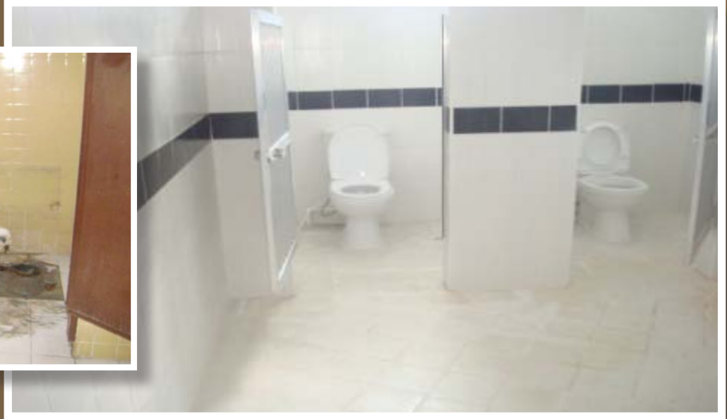
Repairs of comfort rooms at AFPPS Headquarters