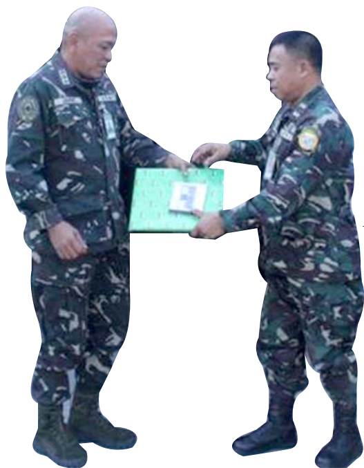
Visit of Commander, AFPPS to 107th CO, Ft. Ramon Magsaysay, Palayan City, Nueva Ecija.