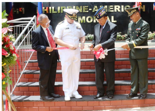
Former President Fidel V Ramos leads inauguration of Philippine-American Memorial at the PMA

The worthwhile activity was aimed at greening the slopes of Mount Manunggal in Barangay Magsaysay, Balamban town, Cebu.