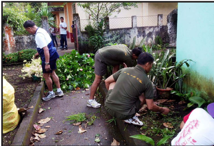
Brigada Eskwela 2014 participants from 303rd Contracting Office.