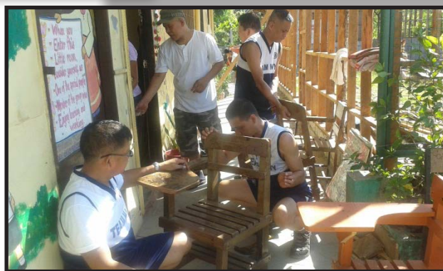
Hand in hand are members of the PNPC as they fix broken arm chairs at the Taguig Science High School.