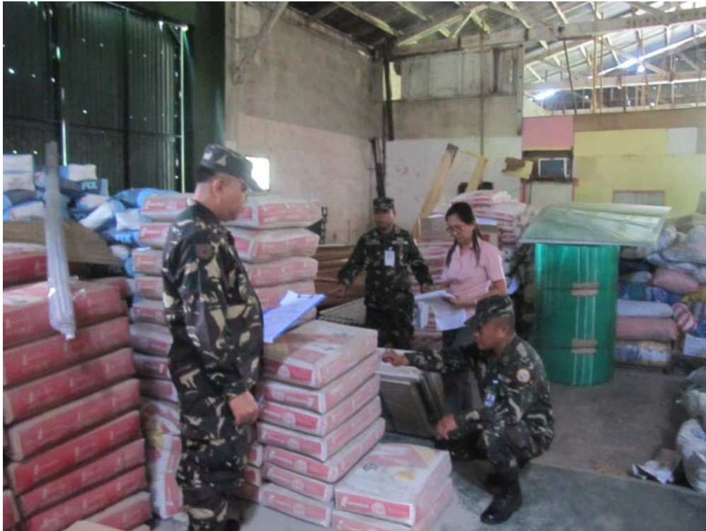
Inspectors of the 107th CO meticulously check construction materials upon delivery by a supplier.