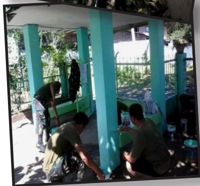
Members of 306th CO all out at the AFPLC Elementary School.