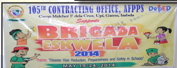
The 105th CO also joined the Brigada Eskwela 2014.