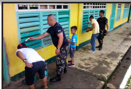
Soldiers from 109th CO join hands with teachers of Tinangis Elementary School in Pili, Camarines Sur.