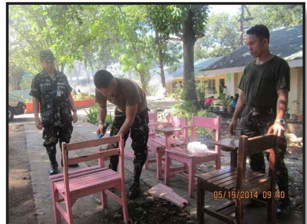
Soldiers from 104th CO fix arm chairs of Camp Evangelista Elementary School.