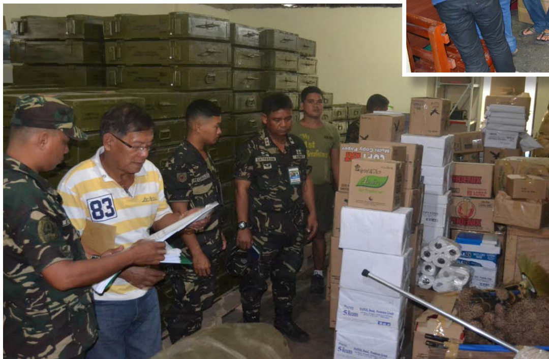
Delivery of various supplies acquired through the Procurement Service Department of Budget and Management (PSDBM) are inspected by personnel of 109th CO.