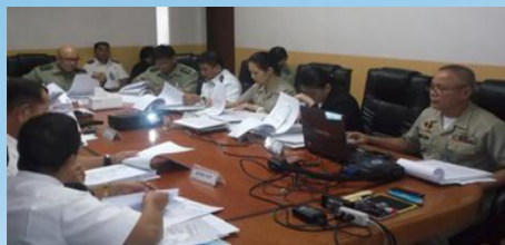
GHQ BAC members during one of their meetings

These AFP projects accumulated a total amount of P 1,929,500.84 as residual in favor for the government.