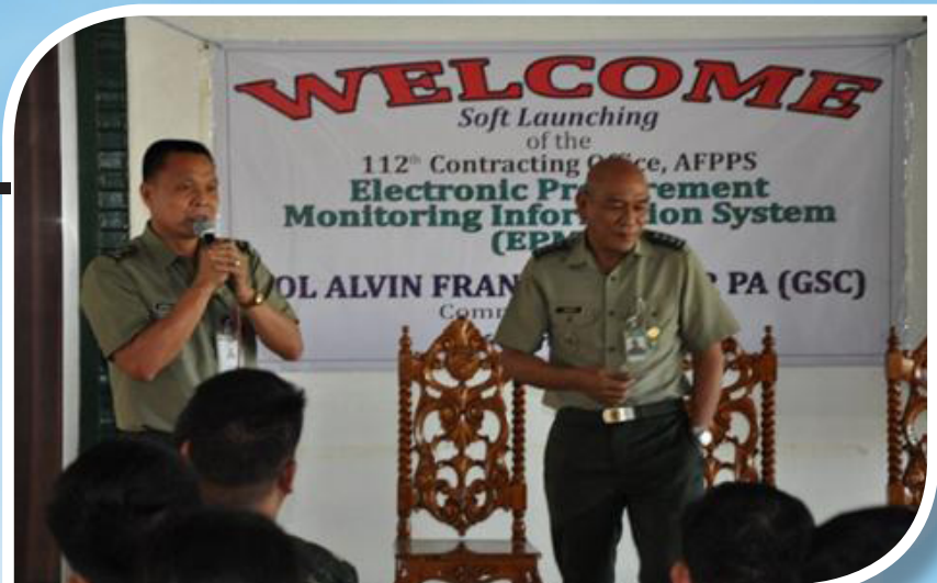
112nd CO hosts Col Javier at the soft launching of Electronic Procurement Monitoring Information System.