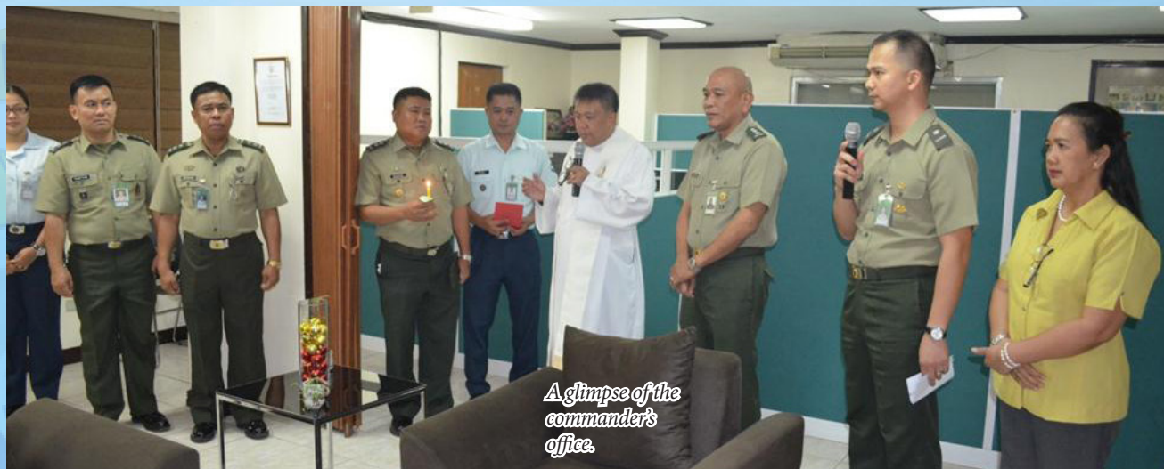
A glimpse of the commander's office.