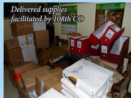
Delivered supplies facilitated by 108th CO

The good coordination between the 108th CO and its catered units resulted in the prompt and timely delivery of required goods and supplies.