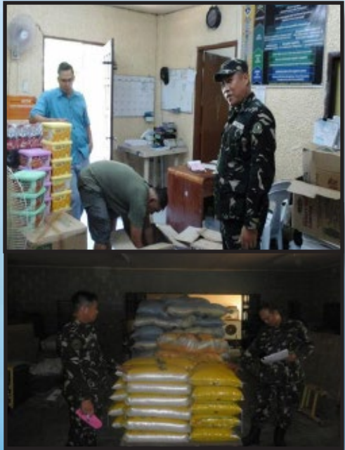
Personnel of the 403rd CO check on the delivered food items for catered units at the Command.