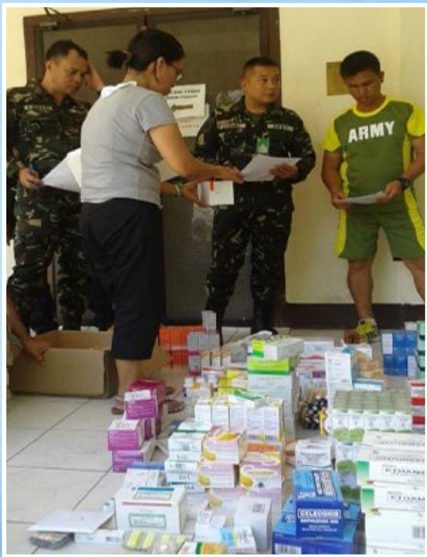
← Elements of 101st CO check on delivered medicines.

AFPPS units meticulously inspect delivered supplies to ensure that only the right and quality items are provided to soldiers.