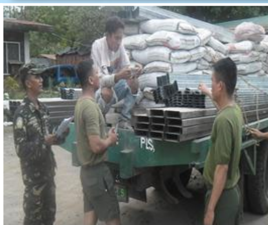
← 104th CO members, along with TIAC personnel of 4ID, meticulously inspect tires and construction materials upon delivery.