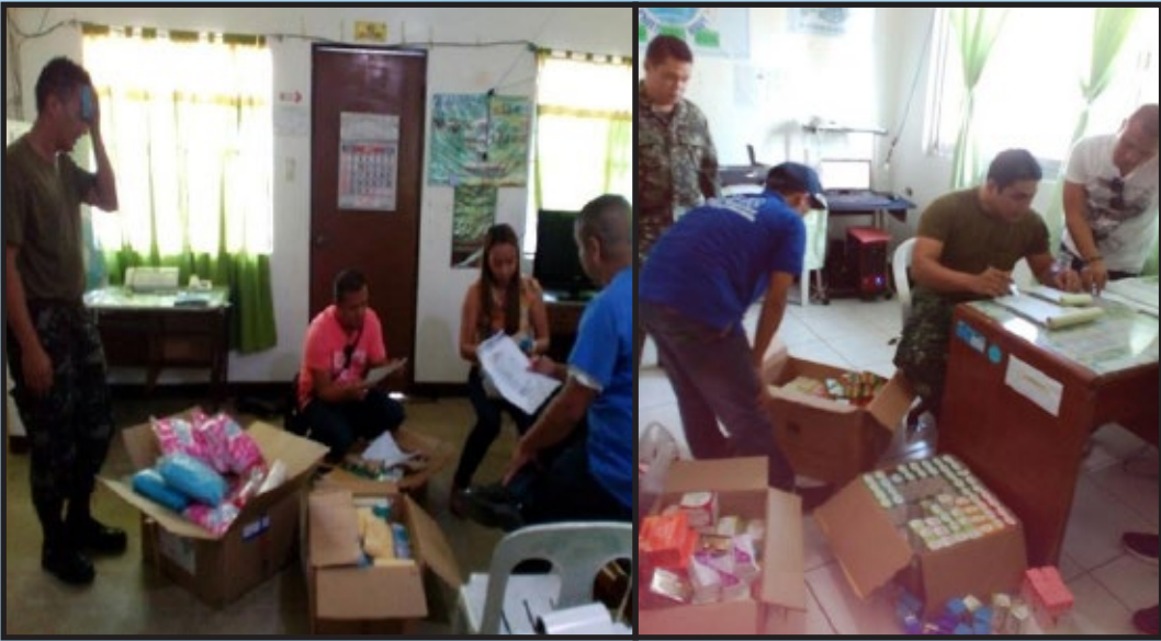
Members of 303rd CO religiously check delivered medical supplies.